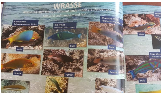
Fantastic resource for our students