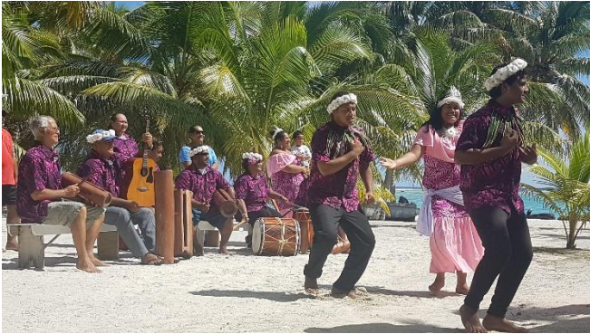
Performing with Community