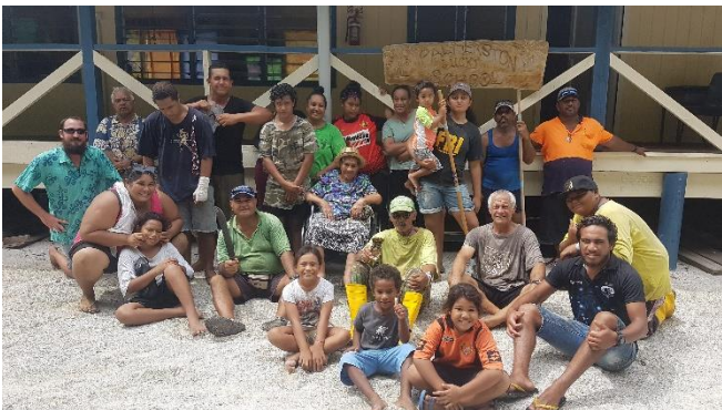
Clean up crew - thank you for helping clean up our school

Just before the cruise ship, our school had a much needed clean up. The back of the school had become very overgrown and in the playground, the grass was growing faster than we could hoe it. A very special thankyou to all who came and helped. Your hard work is most appreciated.