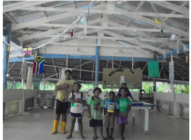
Easter decorations hung up in the multi purpose classroom.