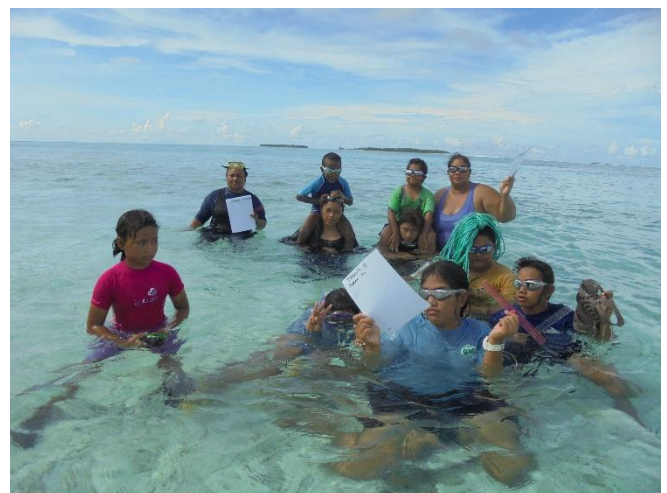
Ongoing end of term clam survey