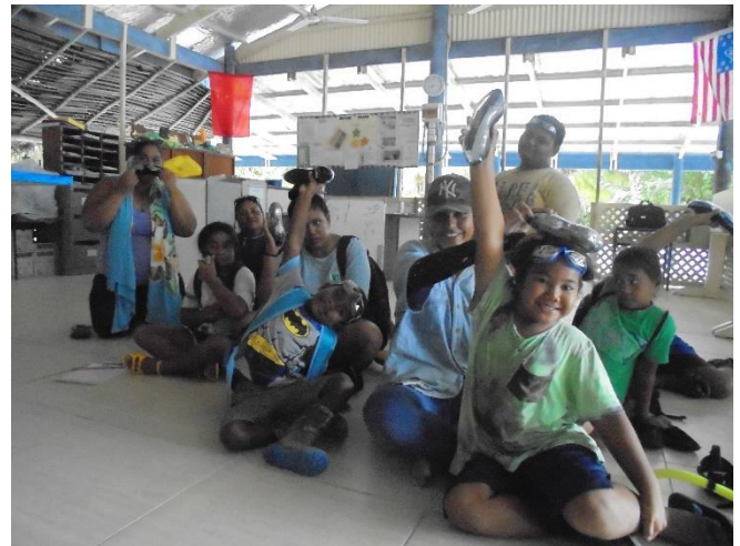
Students with their new swimming goggles

As a science project, the clam survey means students gain real-world experience in data collection, analysing, evaluating, report writing, critical thinking and problem solving. These are "Higher Order Thinking" skills and go well beyond just memorising and understanding facts.