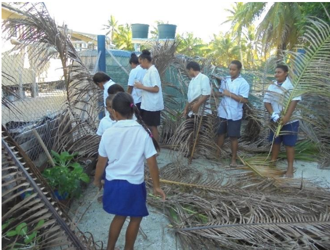
Students working in their garden beds

responsible for watering, weeding, pollinating and just generally taking care of their garden bed. The results have been mixed mostly due to an outbreak of aphids affecting some capsicum plants whilst some cucumber and some bok choy seedlings did not survive transplanting or did not sprout from seed. Nevertheless all students will have a harvest and are looking forward to reaping what they sowed.