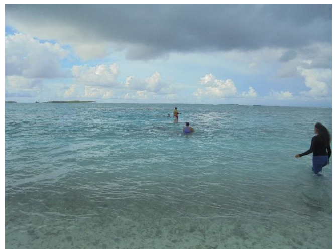
In the field