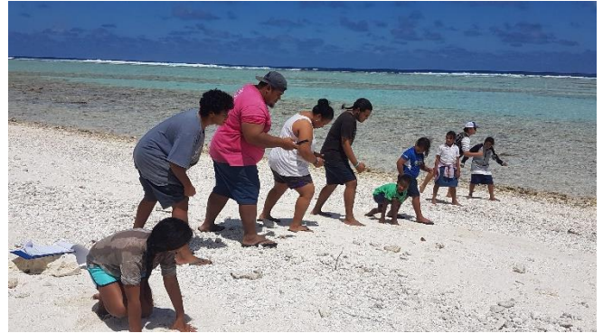
Friday afternoon: Race Around the Island

This term, our Friday PE class included a run around the island. Mrs Nano taught the students how to enter their times into an Excel spreadsheet. From the data entered into the spreadsheet, students were then able to use Excel to graph their progress. Students then analysed the graphs to evaluate and explain each students' performance.