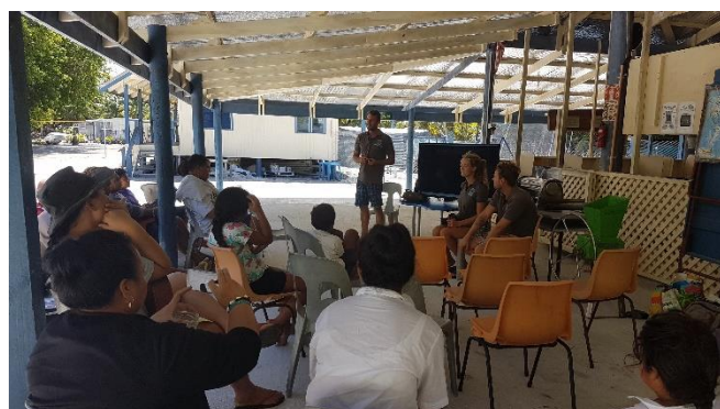
Plastics recycling presentation