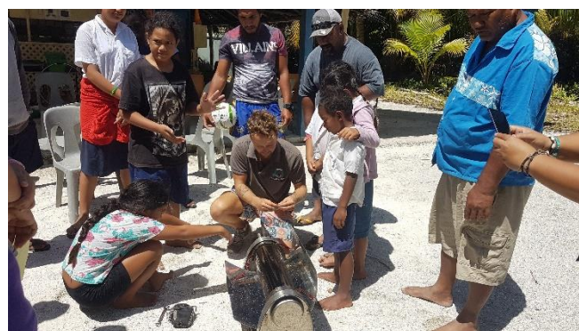
Putting the shredded plastic into the solar powered mould