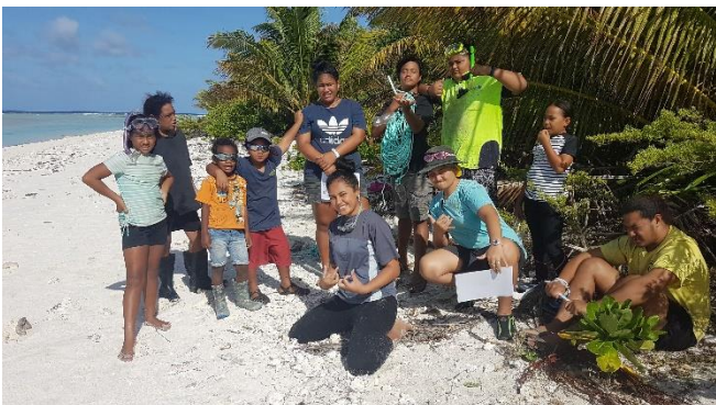
Clam survey team