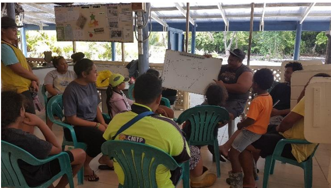
Briefing before going into the field

Term 4 runs for 8 weeks (38 days) from Tuesday, 22 nd October to Friday, 13 th December