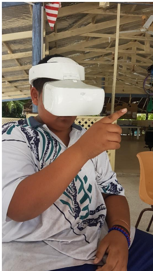
Tamatoa experiencing virtual reality