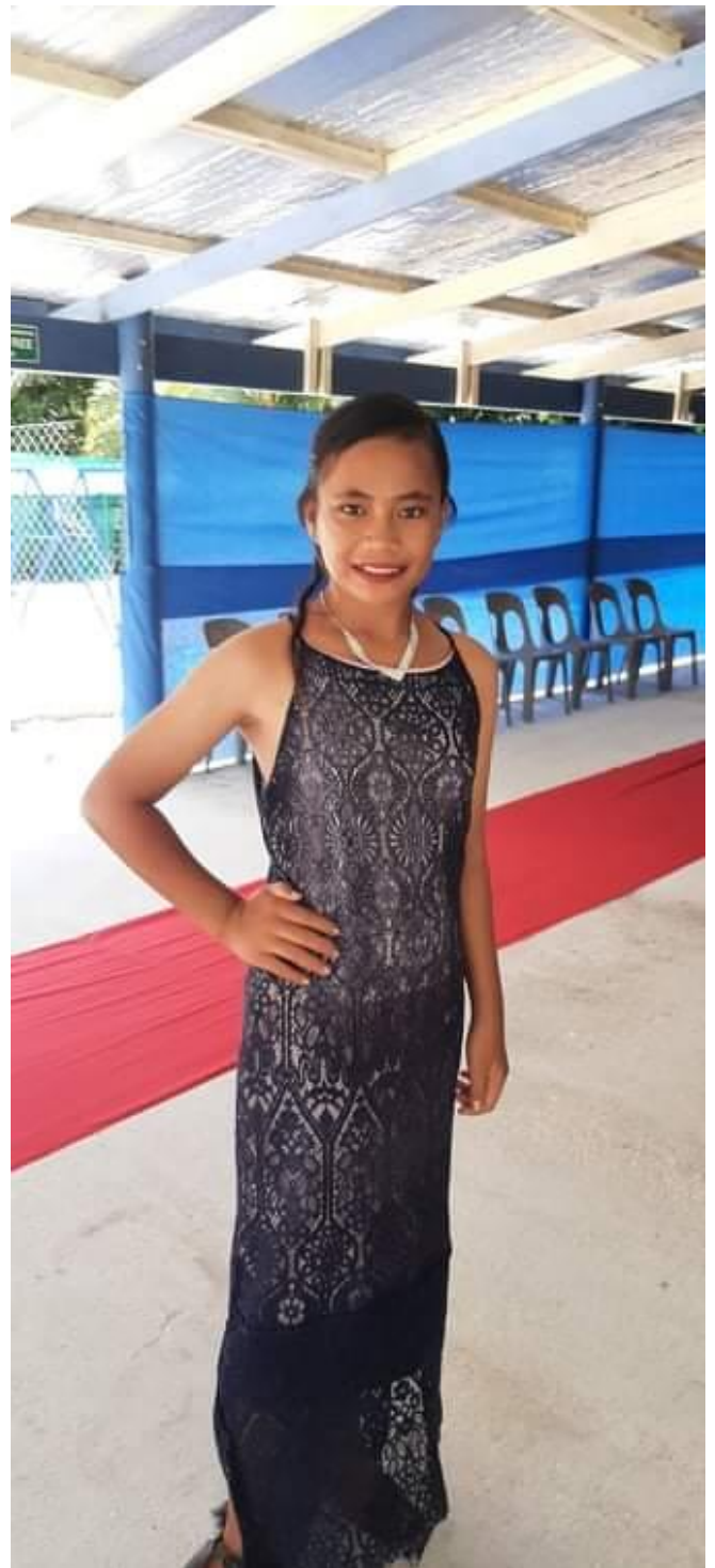
Madeenia: Hollywood style on the red carpet