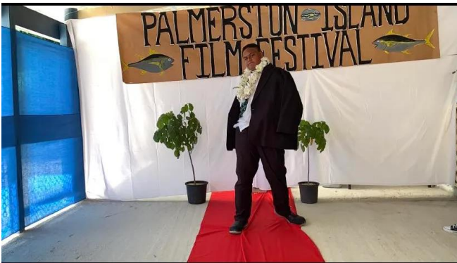
Tamatoa style on the red carpet