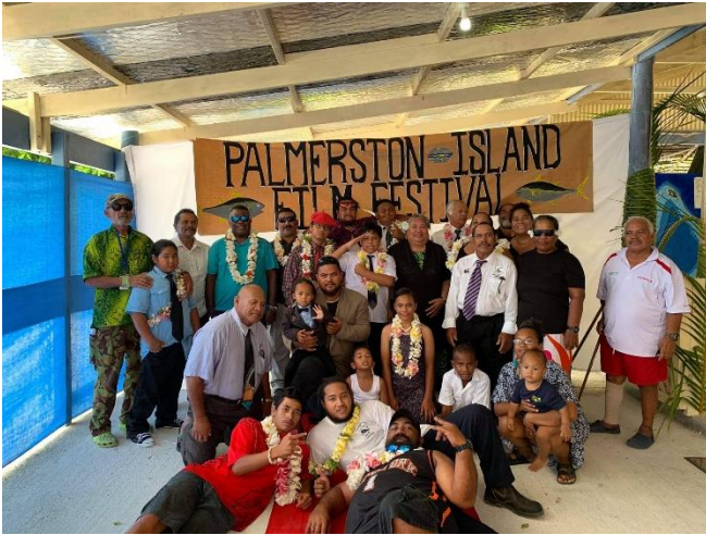
Our stars, our film makers and our community