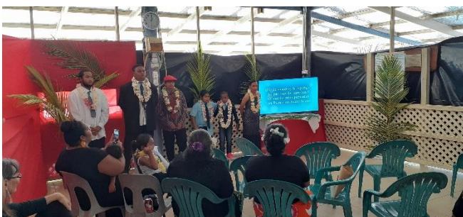
Film makers thanking their stars and supporters