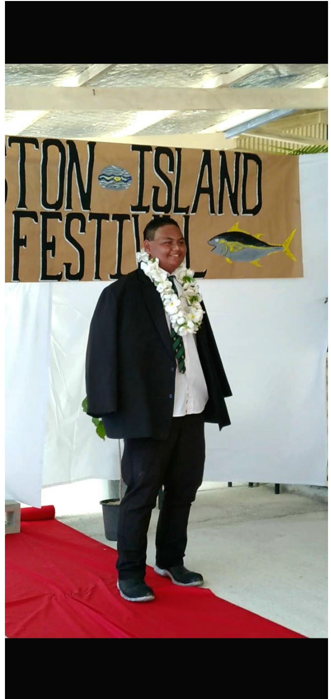
Tamatoa rocking the Hollywood look on the red carpet