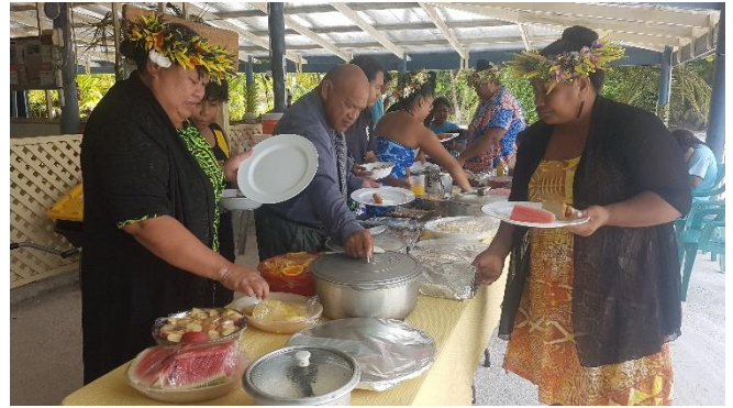
Coming together for a delicious kai kai