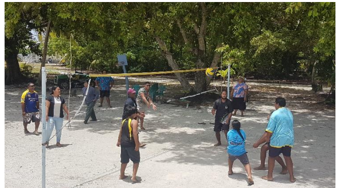
Students vs Community volleyball game