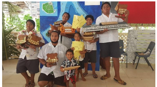
Students with their trophies, certificates and prizes.