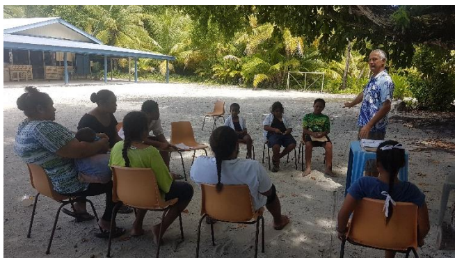
Maori class under the trees