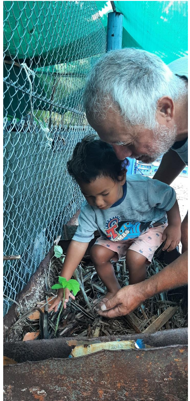
Pati lending a helping hand to E.O.