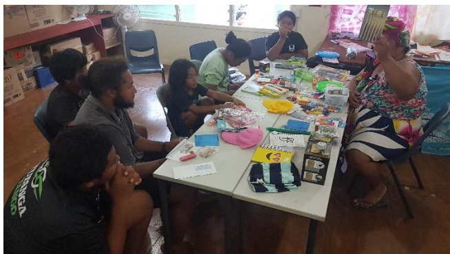
Students bidding at auction. Going once! Going twice! SOLD!

Over the year our students earn rewards represented by stickers on our star chart. Each sticker is worth $1. At the end of the year the stickers are tallied up and each student is given money based on the number of stickers they accumulated. This money is then used to bid for items in an auction. This year students had between $110 and $160 to spend on a variety of many sought after items.