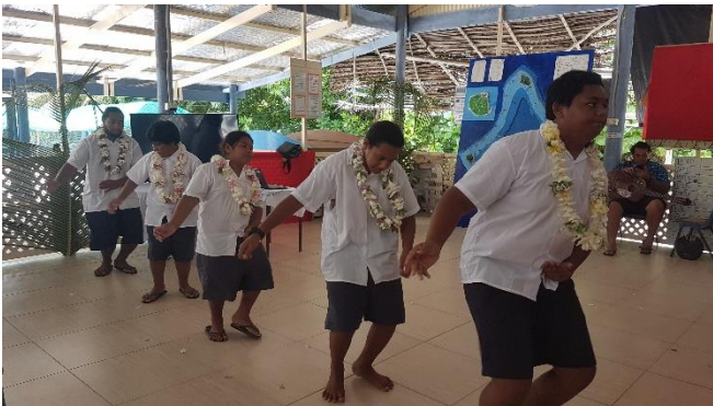
Student dance performance