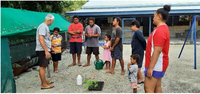
Student briefing for planting out their seedlings