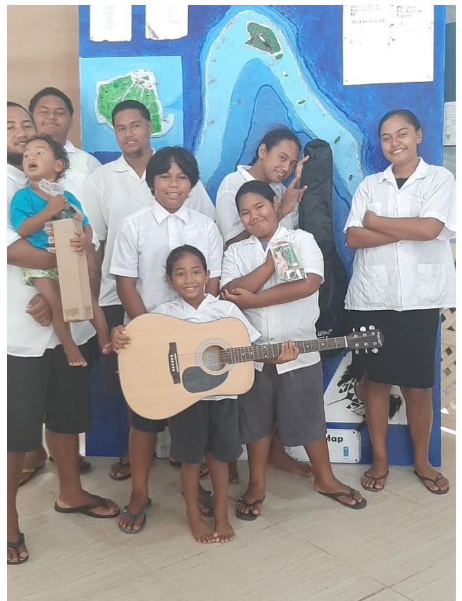
Students with our new guitar