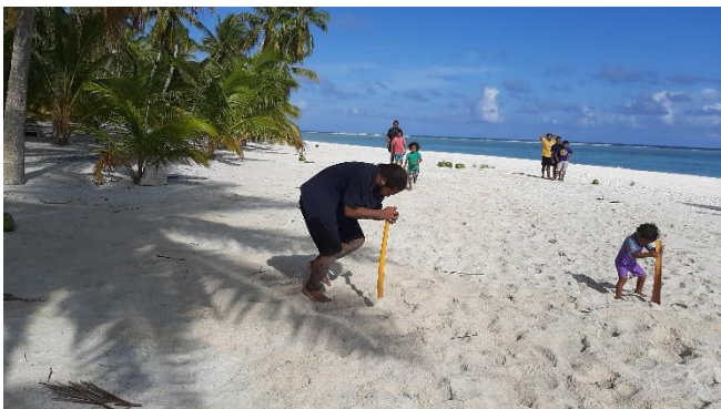
Round the pole race