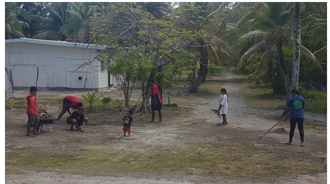
Clean up day- a job well done