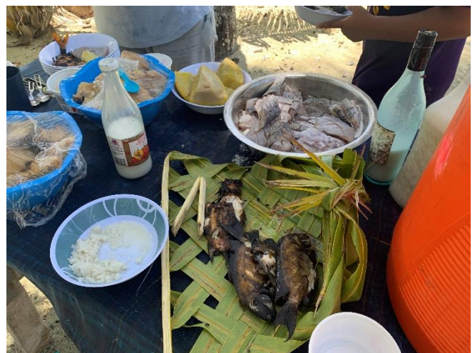
Local food kaikai