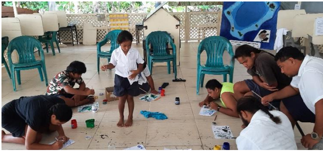
Painting rocks, a tool for mindfulness and well-being