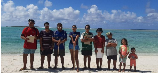
Clam survey team