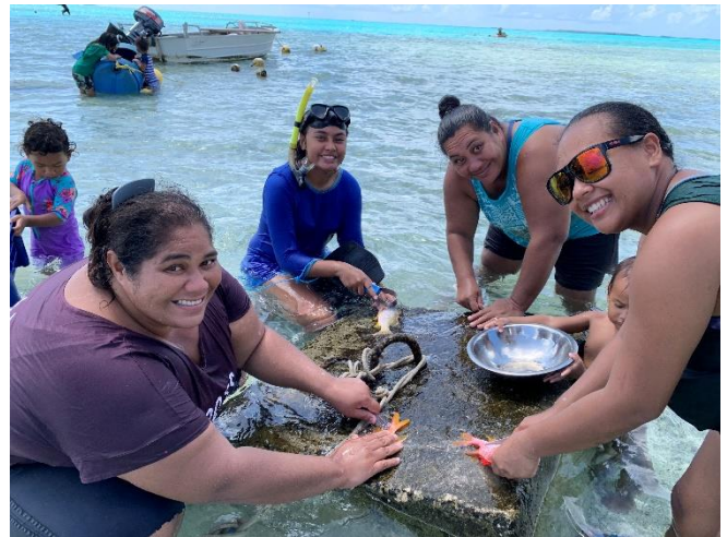
Boys went spearfishing - fresh fish