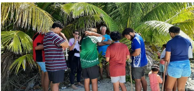
On site clam survey briefing