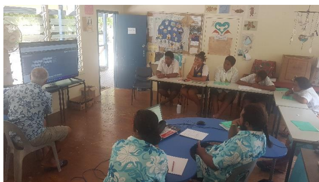
EO demonstrating how to use the Ancestry.com website.

Knowing where you come from is hugely important. This term our EO helped our students understand their family connections and helped them produce a series of family group sheets. He was also able to share his knowledge of research tools such as Ancestry.com and DNA testing.