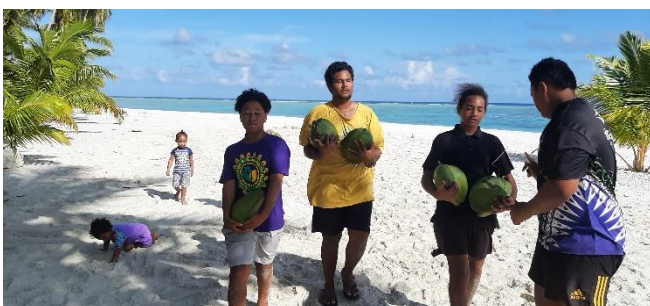
Carry the coconuts