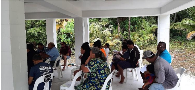
Students attending the sustainability planning meeting